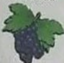
a cluster of grapes