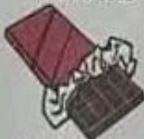
a bar of chocolate