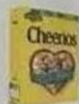
a box of cereals