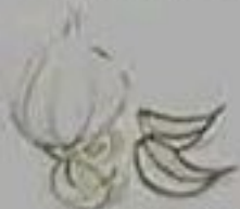
A clove of garlic