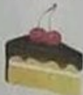
a slice of cake