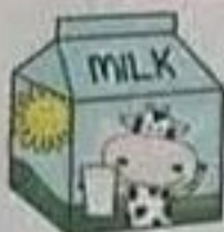
a carton of milk