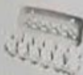
a tray of eggs