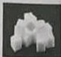
a lump of sugar