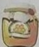
a jar of honey