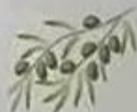
a branch of olives