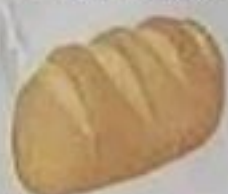
a loaf of bread