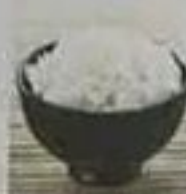
a bowl of rice