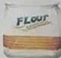
a bag of flour