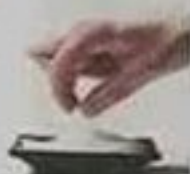
a pinch of salt