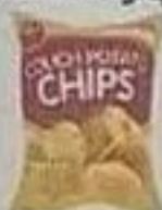
a packet of chips