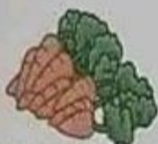
a bunch of carrots