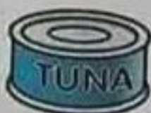
A tin of tuna