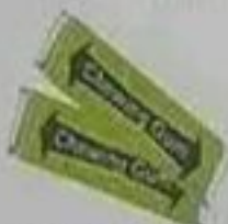
A stick of gum