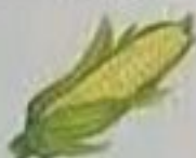
an ear of corn