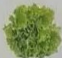
A head of lettuce